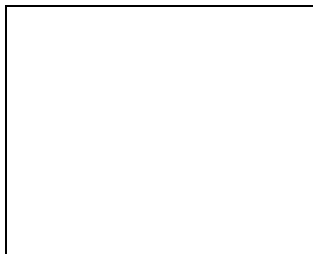
Photograph of Candidate